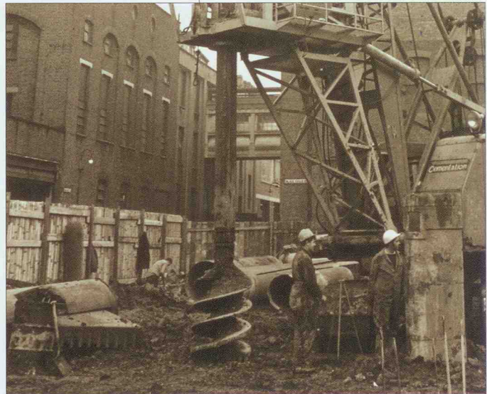
Piling in the 1970s.

» putting in more retaining walls using bored piles to form secant/contiguous bored piled walls," says St John. "It was a dramatic change that made everything cheaper. It created deeper and deeper basements."